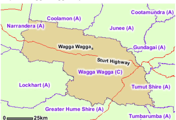
Map 1 – Wagga Wagga City Local Government Area

Wagga Wagga, the largest inland city in New South Wales, is situated at a junction midway between Sydney (518km) and Melbourne (432km). The Wagga Wagga local government area is bordered by eight other local government areas.