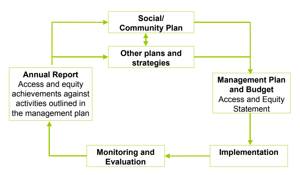
Diagram 1: Key elements of planning and reporting for local councils in NSW

Council's progress against the management plan must be reported on in an annual report. Section 428 (1) of the Act requires councils to prepare a report within five (5) months of end of each year as to its achievements with respect to the objectives and performance targets set out in its management plan for that year. Matters to be included are set in section 428 (1).